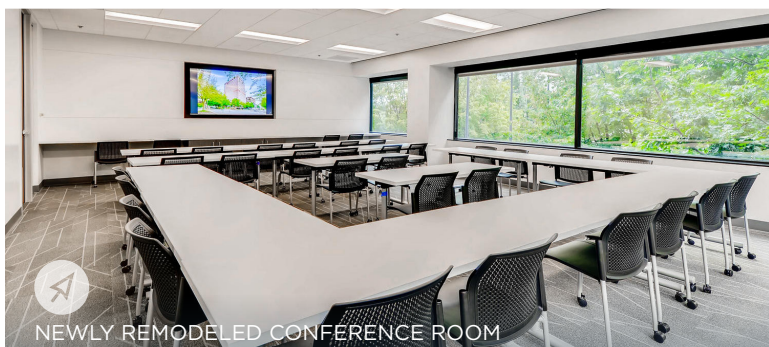
NEWLY REMODELED CONFERENCE ROOM