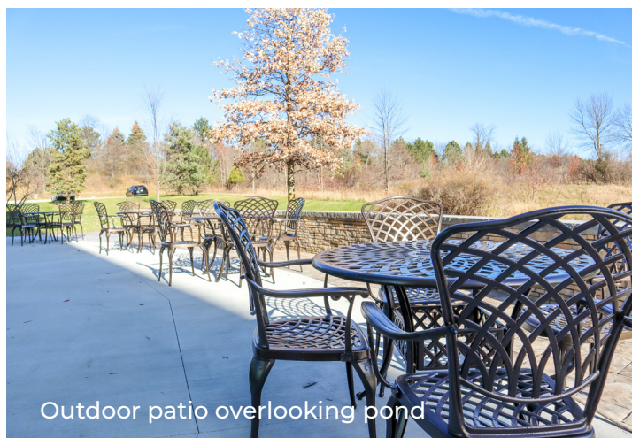
Outdoor patio overlooking pond