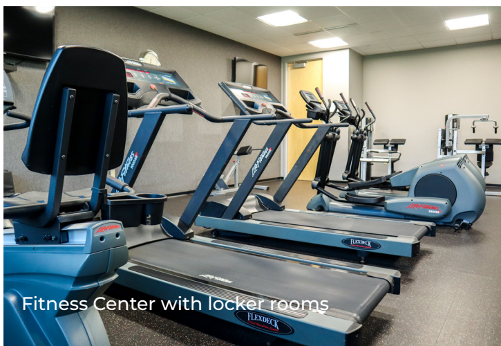
Fitness Center with locker rooms