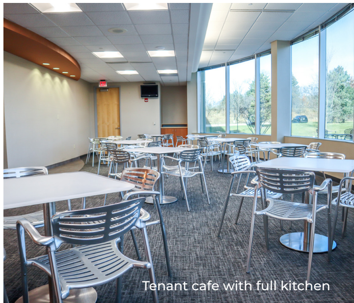
Tenant cafe with full kitchen