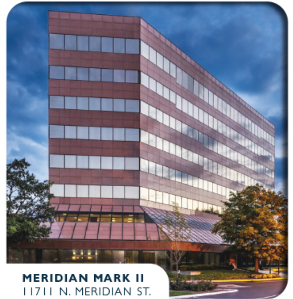
MERIDIAN MARK II 11711 N. MERIDIAN ST.