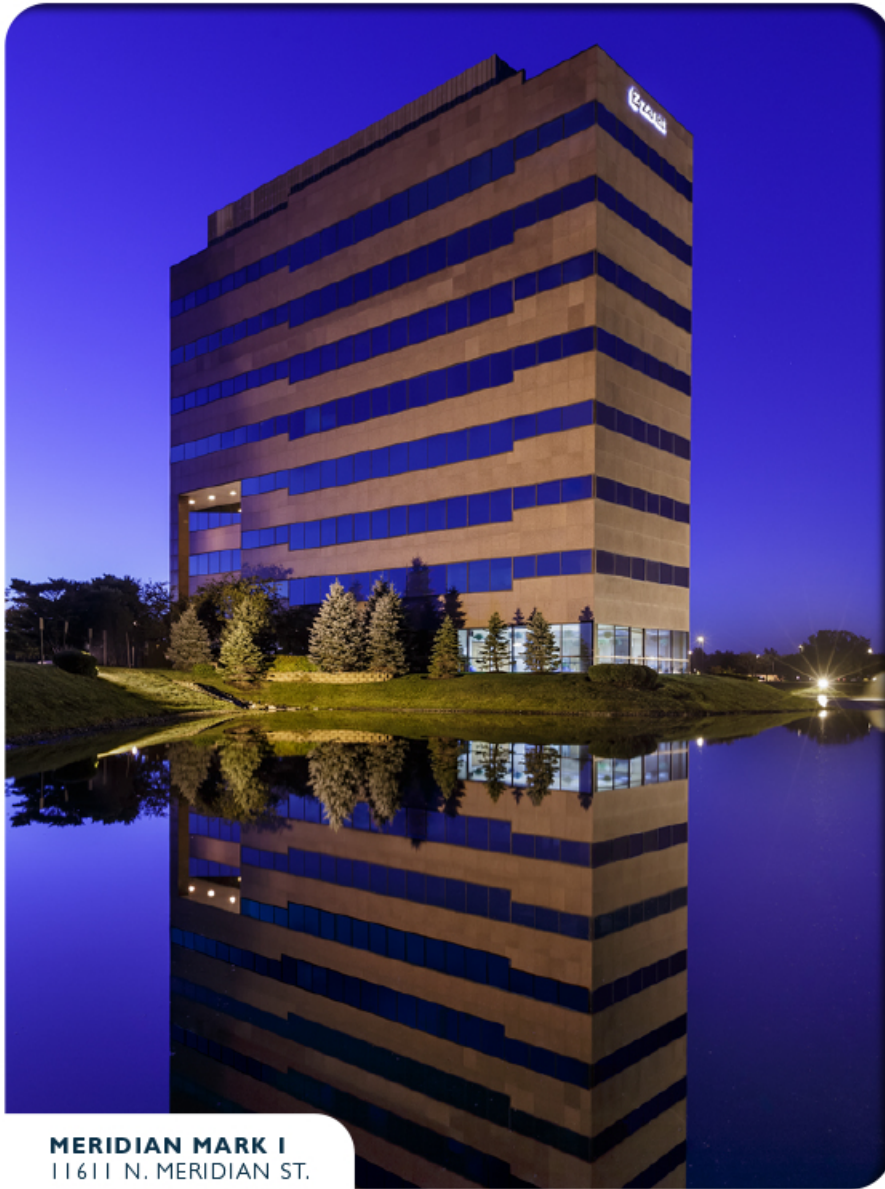
MERIDIAN MARK I 11611 N. MERIDIAN ST.

HAMILTON COUNTY'S MOST PROMINENT OFFICE TOWERS