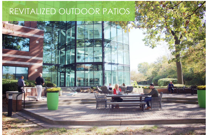
REVITALIZED OUTDOOR PATIOS