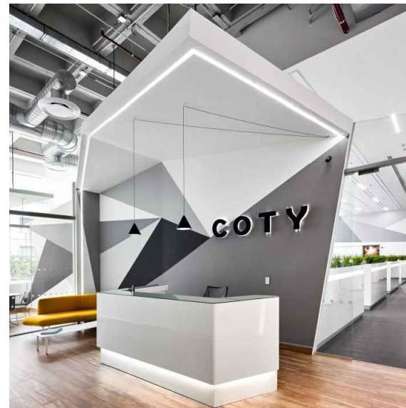
+ RECEPTION DESK + CEILING DETAIL