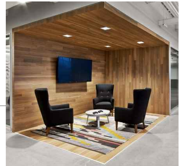
+ COLLABORATION NOOK WITH PLASTIC LAMINATE WALL PANELS